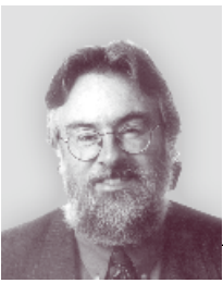
Executive Director's Column